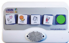
Speech Communication Device