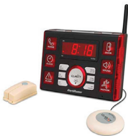
Visual Alert System